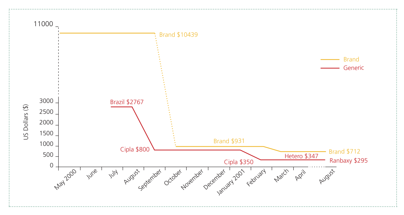
Figure 2 shows the lowest world price per patient per year at each time point. Since August 2001 lowest prices for this combination have dropped still further to $87 USD.